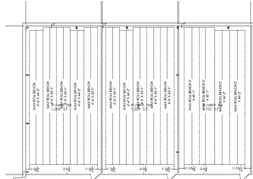
Layout plan of grow method reference image. It shows how roller beds are placed in grow room and the size of roller bed.